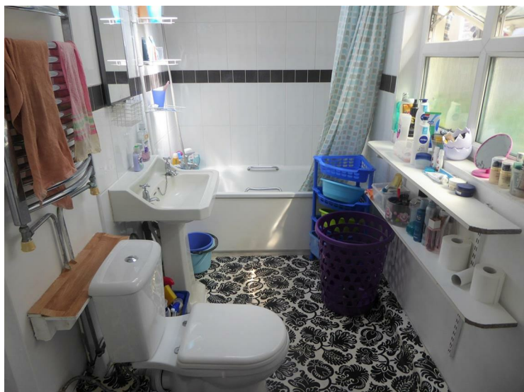
White suite comprising panel enclosed bath, pedestal wash hand basin, low level w/c, part tiled walls, heated towel rail, side aspect double glazed windows.