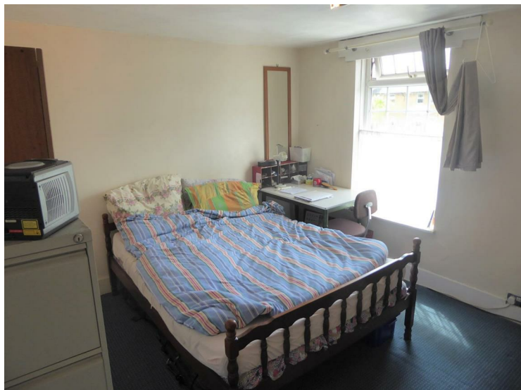
Front aspect double glazed window, power point, radiator.