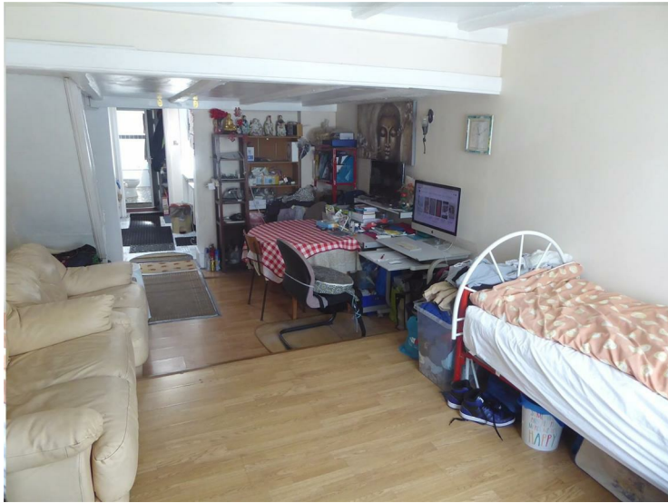
Front aspect double glazed window, two radiators, laminate flooring, stairs to first floor landing, through to...