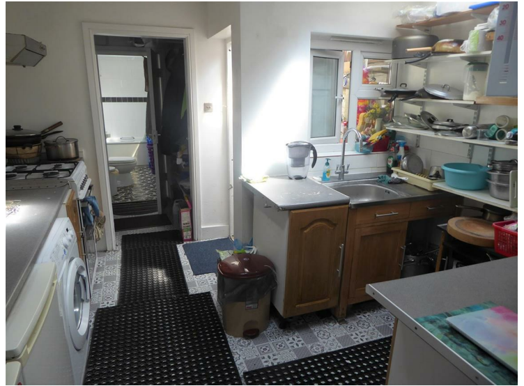
Single drainer stainless steel sink unit with mixer tap and cupboard below, further wall mounted units, space for cooker, space for washing machine and fridge/freezer, double glazed window, wall mounted "Vaillant" boiler, skylights, door to rear garden.