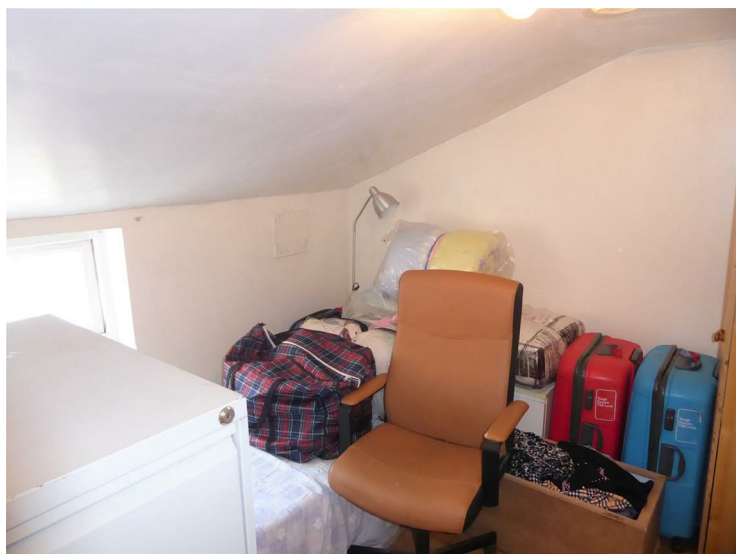
Rear aspect double glazed window, radiator, built-in cupboard.