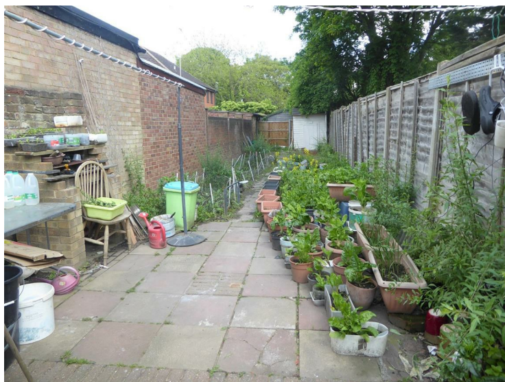
Paved patio area, brick built barbeque, paved pathway with decking area.